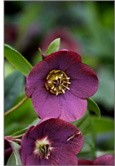
Honeymoon Rome In Red Hellebore flowers

Honeymoon Rome In Red Hellebore is recommended for the following landscape applications;