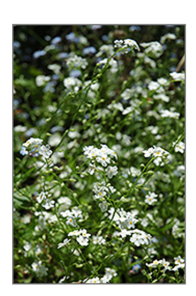
Alba Forget-Me-Not flowers

Alba Forget-Me-Not will grow to be about 12 inches tall at maturity, with a spread of 12 inches. When grown in masses or used as a bedding plant, individual plants should be spaced approximately 10 inches apart. It grows at a fast rate, and tends to be biennial, meaning that it puts on vegetative growth the first year, flowers the second, and then dies. However, this species tends to self-seed and will thereby endure for years in the garden if allowed. As this plant tends to go dormant in summer, it is best interplanted with late-season bloomers to hide the dying foliage.