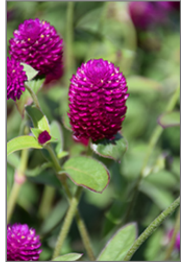
Ping Pong Purple Globe Amaranth flowers