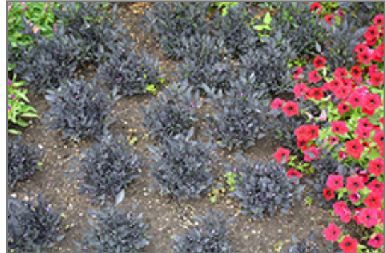
Onyx Red Ornamental Pepper