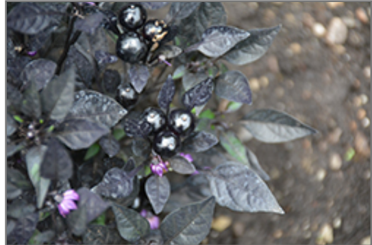
Onyx Red Ornamental Pepper fruit

Onyx Red Ornamental Pepper is an herbaceous annual with an upright spreading habit of growth. Its medium texture blends into the garden, but can always be balanced by a couple of finer or coarser plants for an effective composition.