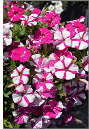
Headliner Pink Sky Petunia flowers