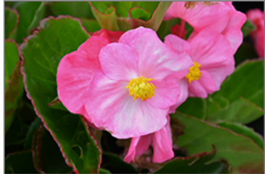
Tophat Pink Begonia flowers

Tophat Pink Begonia is recommended for the following landscape applications;