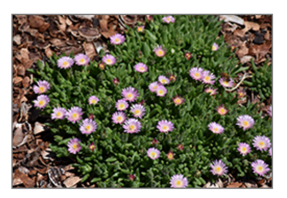
Jewel Of Desert Rosequartz Ice Plant in bloom