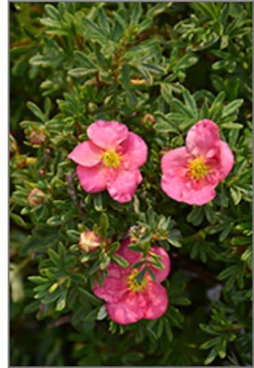
Bella Bellissima Potentilla flowers