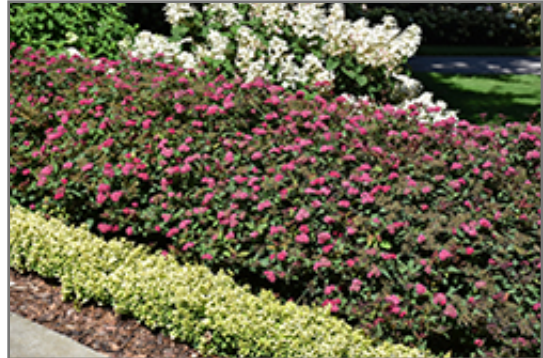
Double Play Doozie Spirea in bloom

Double Play Doozie Spirea is recommended for the following landscape applications;