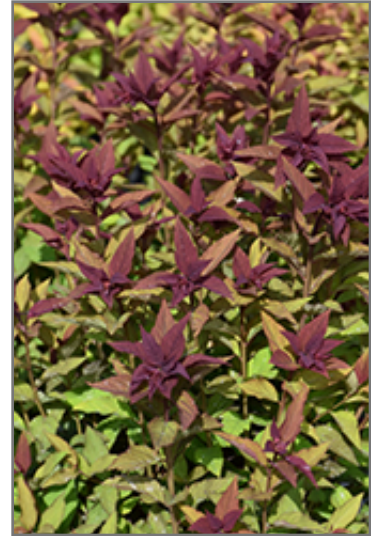
Double Play Doozie Spirea foliage

This shrub should only be grown in full sunlight. It prefers to grow in average to moist conditions, and shouldn't be allowed to dry out. It is not particular as to soil type or pH. It is highly tolerant of urban pollution and will even thrive in inner city environments. This particular variety is an interspecific hybrid.