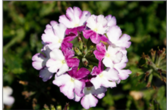
Firehouse Purple Fizz Verbena flowers

Firehouse Purple Fizz Verbena is recommended for the following landscape applications;