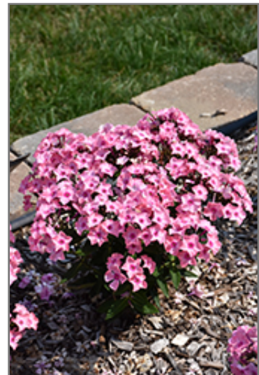
Sweet Summer Queen Garden Phlox in bloom