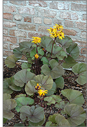
Britt Marie Crawford Rayflower in bloom