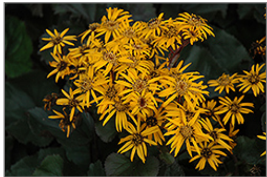
Britt Marie Crawford Rayflower flowers