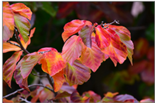
Persian Parrotia in fall