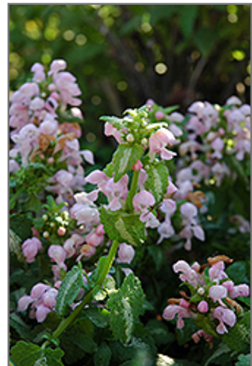
Shell Pink Spotted Dead Nettle flowers