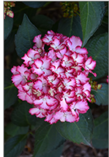
Seaside Serenade Fire Island Hydrangea flowers