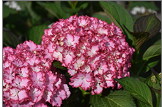
Seaside Serenade Fire Island Hydrangea flowers

Seaside Serenade Fire Island Hydrangea is recommended for the following landscape applications;