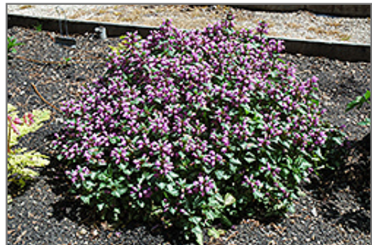
Beacon Silver Spotted Dead Nettle in bloom