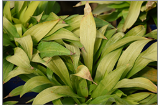
Munchkin Fire Hosta foliage