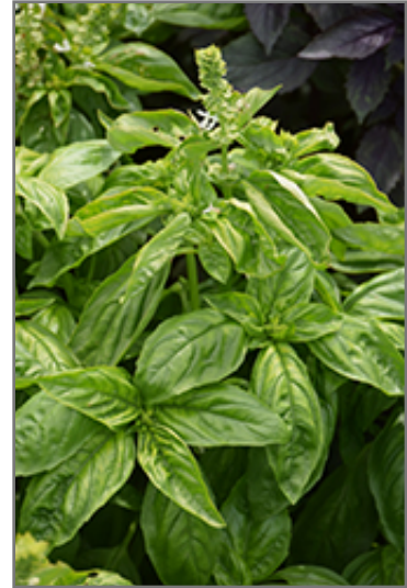
Genovese Basil foliage

This plant can be integrated into a landscape or flower garden by creative gardeners, but is usually grown in a designated herb garden. It should only be grown in full sunlight. It prefers to grow in average to moist conditions, and shouldn't be allowed to dry out. It is not particular as to soil type or pH. It is somewhat tolerant of urban pollution. This is a selected variety of a species not originally from North America. It can be propagated by cuttings; however, as a cultivated variety, be aware that it may be subject to certain restrictions or prohibitions on propagation.