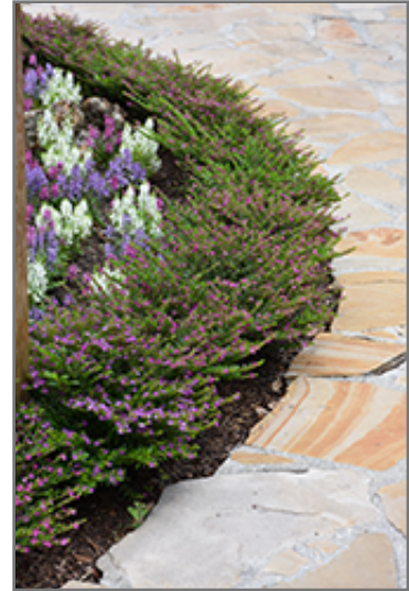
FloriGlory Diana Mexican Heather flowers