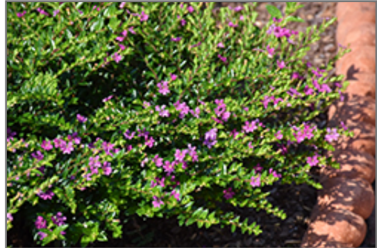
FloriGlory Diana Mexican Heather flowers

FloriGlory Diana Mexican Heather will grow to be about 14 inches tall at maturity, with a spread of 24 inches. When grown in masses or used as a bedding plant, individual plants should be spaced approximately 18 inches apart. Its foliage tends to remain dense right to the ground, not requiring facer plants in front. Although it's not a true annual, this fast-growing plant can be expected to behave as an annual in our climate if left outdoors over the winter, usually needing replacement the following year. As such, gardeners should take into consideration that it will perform differently than it would in its native habitat.