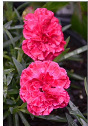
Fruit Punch Raspberry Ruffles Pinks flowers