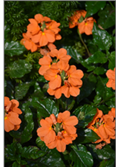
Orange Marmalade Firecracker Plant flowers

This plant does best in full sun to partial shade. It does best in average to evenly moist conditions, but will not tolerate standing water. It is not particular as to soil pH, but grows best in rich soils. It is somewhat tolerant of urban pollution. This is a selected variety of a species not originally from North America. It can be propagated by cuttings; however, as a cultivated variety, be aware that it may be subject to certain restrictions or prohibitions on propagation.