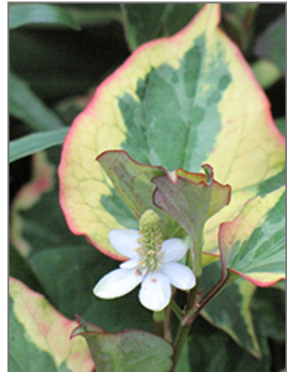
Chameleon Houttuynia flowers