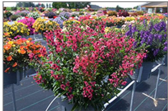
Archangel Cherry Red Angelonia in bloom