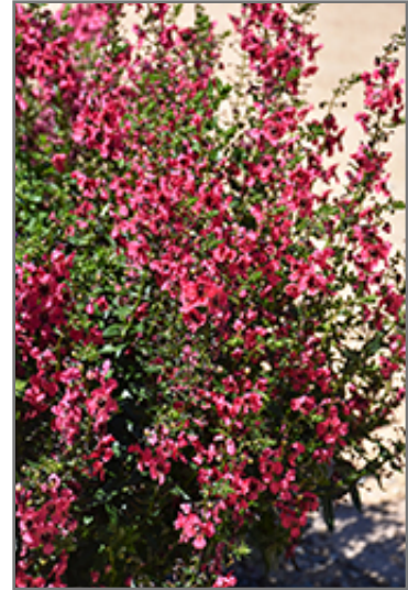
Archangel Cherry Red Angelonia flowers

This plant will require occasional maintenance and upkeep, and should not require much pruning, except when necessary, such as to remove dieback. It is a good choice for attracting butterflies to your yard, but is not particularly attractive to deer who tend to leave it alone in favor of tastier treats. It has no significant negative characteristics.