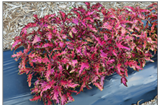
Under The Sea Pink Reef Coleus