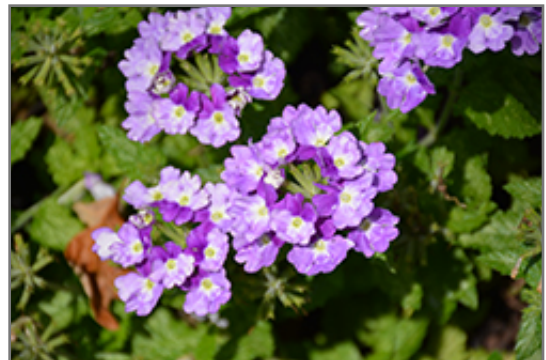
Superbena Sparkling Amethyst Verbena flowers