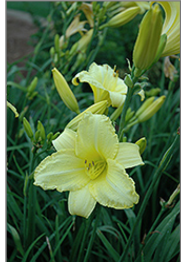
Happy Ever Appster Happy Returns Daylily flowers

Happy Ever Appster Happy Returns Daylily is recommended for the following landscape applications;