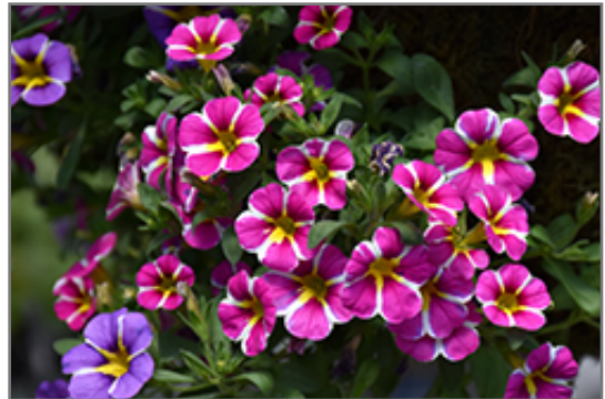
Superbells Rising Star Calibrachoa flowers