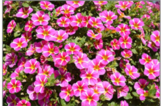
Superbells Rising Star Calibrachoa flowers

This plant will require occasional maintenance and upkeep. Trim off the flower heads after they fade and die to encourage more blooms late into the season. It is a good choice for attracting bees and hummingbirds to your yard, but is not particularly attractive to deer who tend to leave it alone in favor of tastier treats. It has no significant negative characteristics.