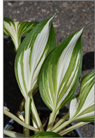
Cool As A Cucumber Hosta foliage

Cool As A Cucumber Hosta is recommended for the following landscape applications;