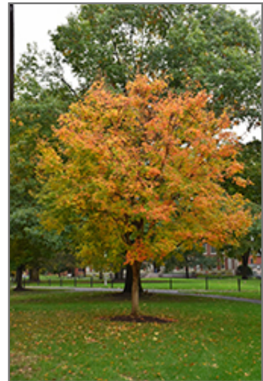
Three Flowered Maple in fall