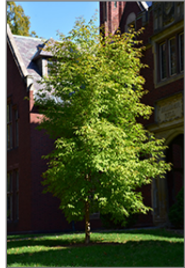
Three Flowered Maple

Three Flowered Maple will grow to be about 20 feet tall at maturity, with a spread of 15 feet. It has a low canopy with a typical clearance of 5 feet from the ground, and should not be planted underneath power lines. It grows at a slow rate, and under ideal conditions can be expected to live for 70 years or more.