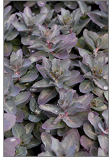
Cherry Truffle Stonecrop foliage

Cherry Truffle Stonecrop is a fine choice for the garden, but it is also a good selection for planting in outdoor pots and containers. It is often used as a 'filler' in the 'spiller-thriller-filler' container combination, providing a mass of flowers and foliage against which the larger thriller plants stand out. Note that when growing plants in outdoor containers and baskets, they may require more frequent waterings than they would in the yard or garden.