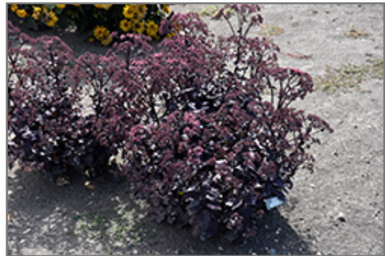
Cherry Truffle Stonecrop in bloom