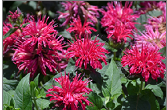
Balmy Rose Beebalm flowers

Balmy Rose Beebalm is recommended for the following landscape applications;