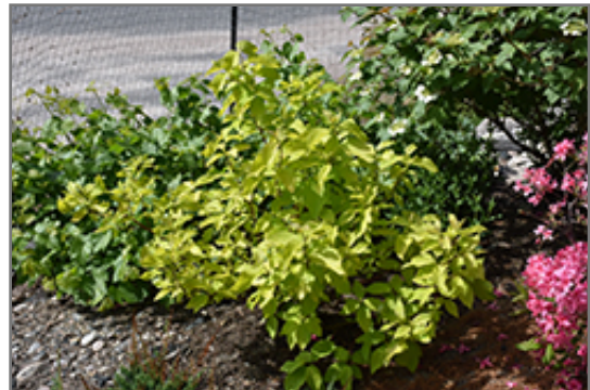
Neon Burst Dogwood