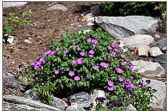
Bloody Cranesbill in bloom