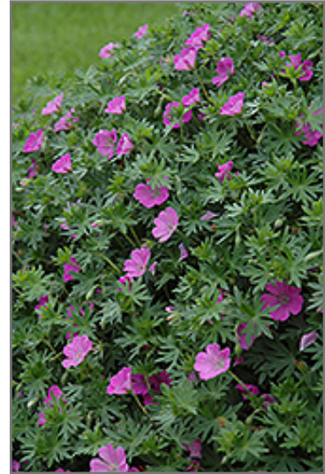
Bloody Cranesbill flowers

Bloody Cranesbill is recommended for the following landscape applications;