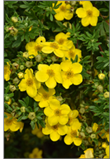
Happy Face Yellow Potentilla flowers