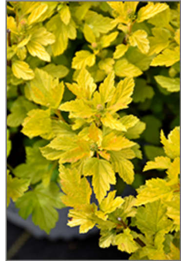
Tiny Wine Gold Ninebark foliage