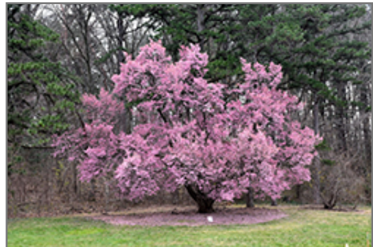
Okame Flowering Cherry in bloom