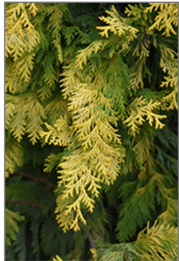
Cripps Gold Falsecypress foliage