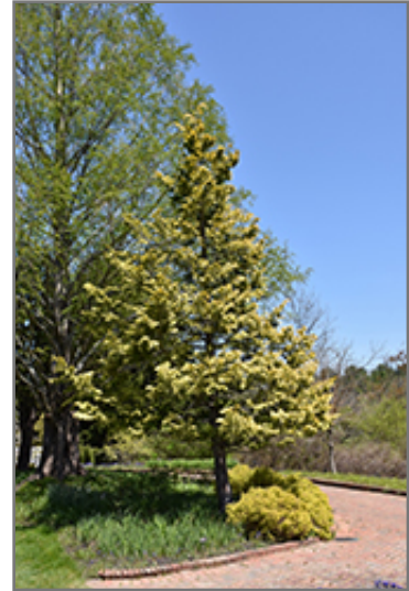
Cripps Gold Falsecypress

This tree does best in full sun to partial shade. It prefers to grow in average to moist conditions, and shouldn't be allowed to dry out. It is not particular as to soil type or pH. It is highly tolerant of urban pollution and will even thrive in inner city environments, and will benefit from being planted in a relatively sheltered location. Consider applying a thick mulch around the root zone in winter to protect it in exposed locations or colder microclimates. This is a selected variety of a species not originally from North America.