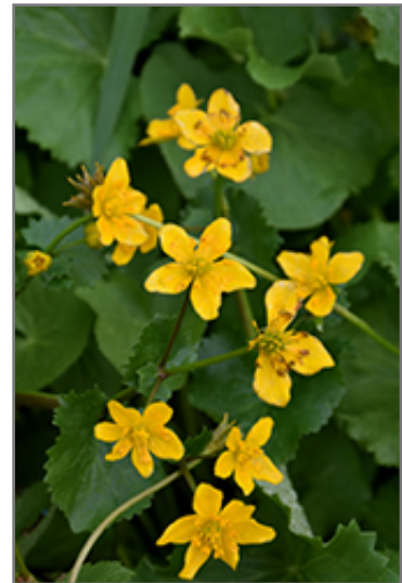
Marsh Marigold flowers