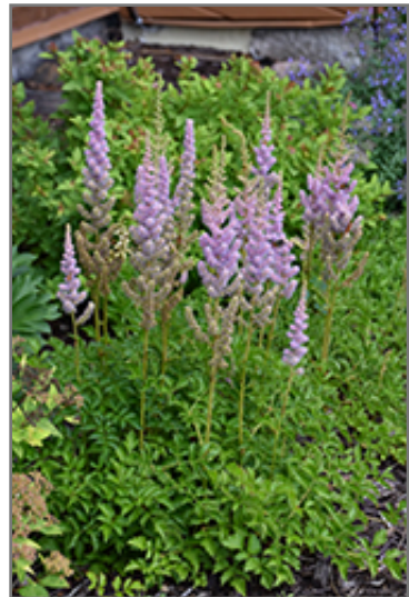
Dwarf Chinese Astilbe in bloom