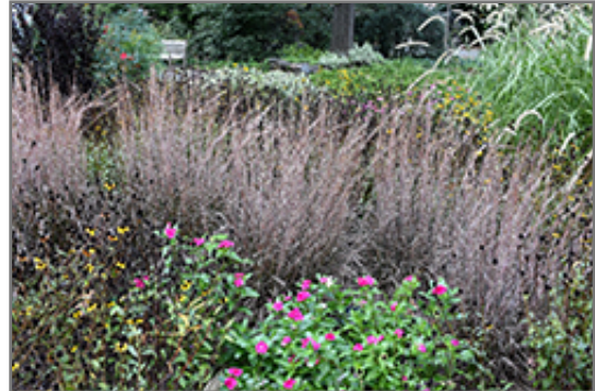
Standing Ovation Bluestem in fall