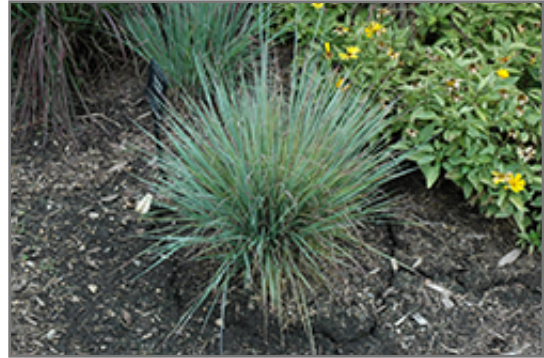
Standing Ovation Bluestem