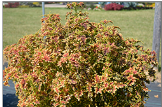
Under The Sea Copper Coral Coleus