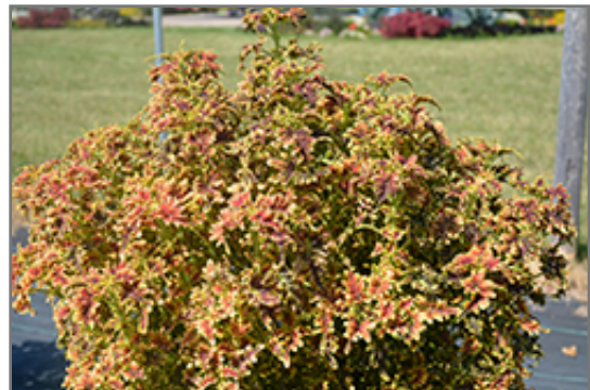
Under The Sea Copper Coral Coleus