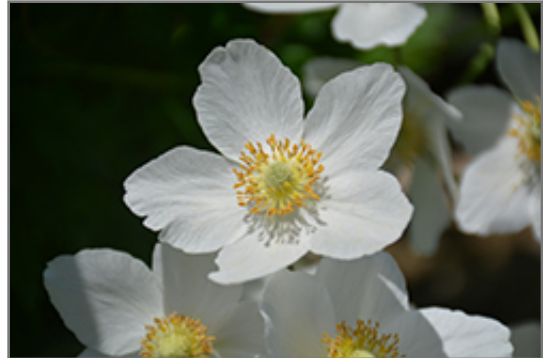
Windflower flowers