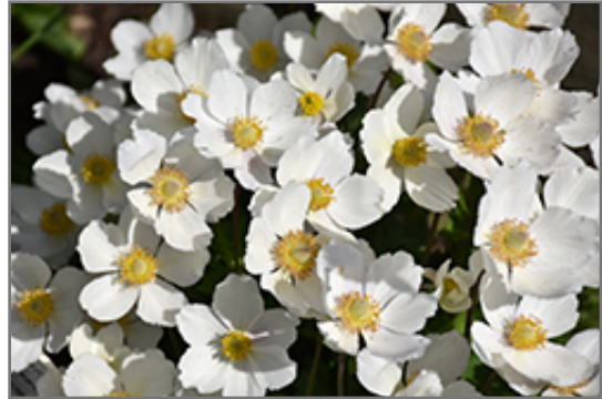
Windflower flowers