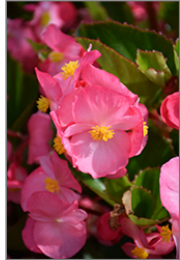
Big Pink Green Leaf Begonia flowers