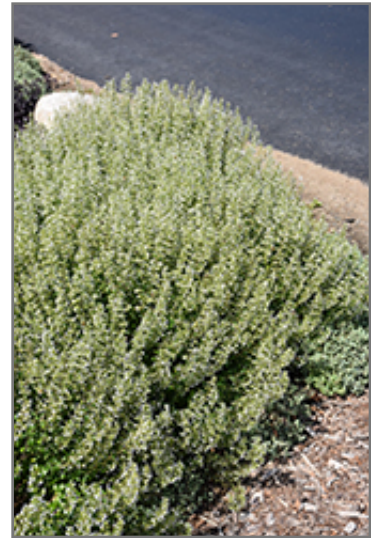
White Cloud Dwarf Calamint in bloom