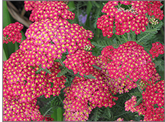
Galaxy Paprika Yarrow flowers

Galaxy Paprika Yarrow is recommended for the following landscape applications;