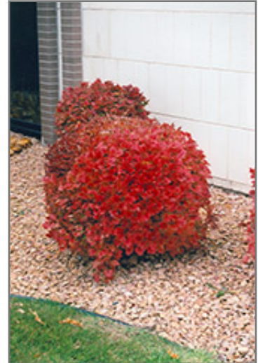
Bailey Compact Highbush Cranberry in fall

This shrub performs well in both full sun and full shade. It is quite adaptable, preferring to grow in average to wet conditions, and will even tolerate some standing water. It is not particular as to soil type or pH. It is highly tolerant of urban pollution and will even thrive in inner city environments. This is a selection of a native North American species.