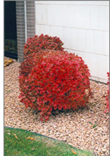
Bailey Compact Highbush Cranberry in fall

This shrub performs well in both full sun and full shade. It is quite adaptable, preferring to grow in average to wet conditions, and will even tolerate some standing water. It is not particular as to soil type or pH. It is highly tolerant of urban pollution and will even thrive in inner city environments. This is a selection of a native North American species.