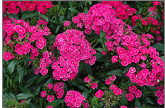
Jolt Pink Hybrid Pinks flowers

Jolt Pink Hybrid Pinks is recommended for the following landscape applications;