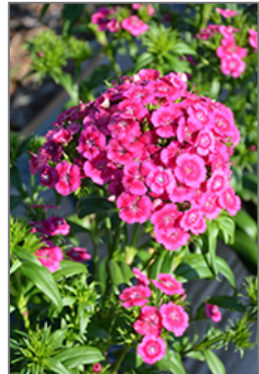
Jolt Pink Hybrid Pinks flowers