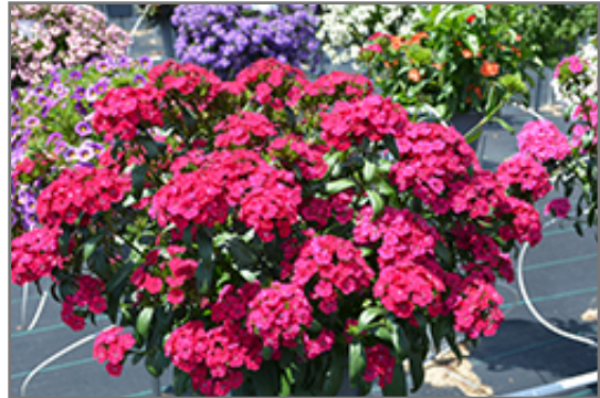
Jolt Cherry Hybrid Pinks in bloom