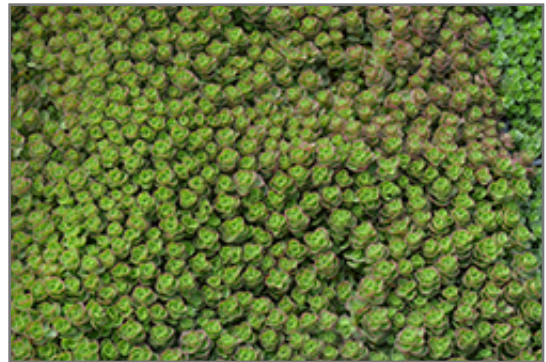
Dragon's Blood Stonecrop foliage