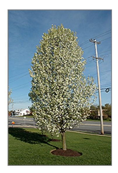
Cleveland Select Flowering Pear in bloom