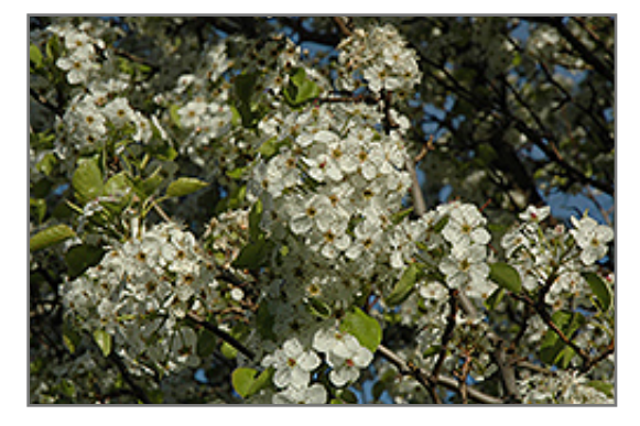
Cleveland Select Flowering Pear flowers